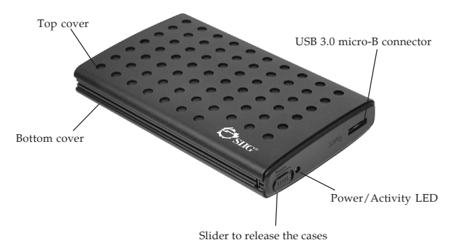
Figure 1: Back Panel Layout